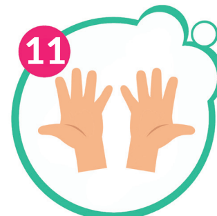
11 Hands are now safe