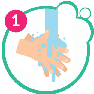
1 Wet hands with warm water