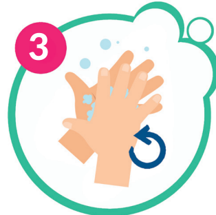
3 Rub hands palm to palm