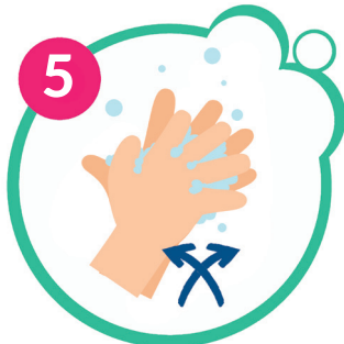
5 Palm to palm with fingers interlaced