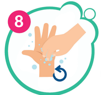
8 Rub fingertips of right hand into clasped left palm and vice versa