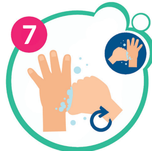
7 Rotate left thumb with clasped right palm and vice versa