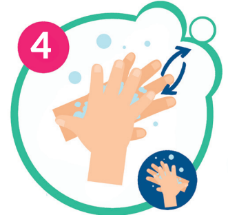
4 Right palm over the back of left hand with interlaced fingers and vice versa