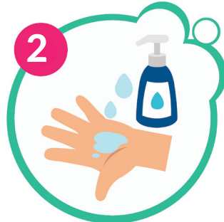
2 Apply enough soap to cover all hand surfaces