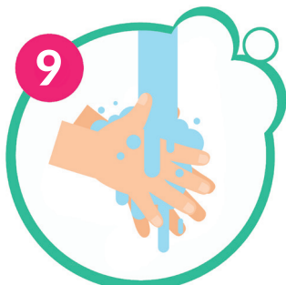
9 Rinse hands with warm water