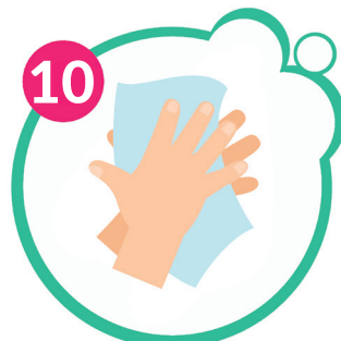
10 Using a single use towel, dry hands and then use to turn faucet off